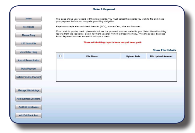
Upload Payroll Withholding Data